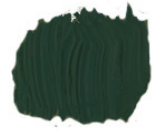
SAP GREEN (T)