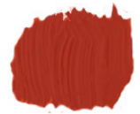
INDIAN YELLOW (T)