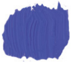
DIOXAZINE VIOLET (T)