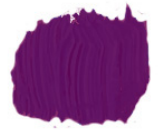
QUINACRIDONE VIOLET (T)