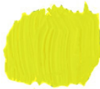
CAD LEMON YELLOW