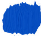
ULTRA MARINE LIGHT (T)