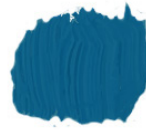
PHTHALO TURQUOISE BLUE (T)