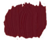
ROSE VIOLET (T)